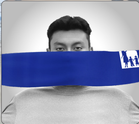
Step #1 Fold In Half Cover Face